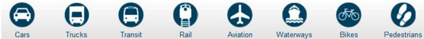
Figure 8-2: MnDOT Transportation Modes

In late 2003, MnDOT was authorized to establish the first MnPASS express lanes west of Minneapolis. This program converted the existing inner lanes of Highway I-394 into high occupancy toll (HOT) lanes. This program was expanded to include new managed lanes on I-35W in 2009. Future plans for expanding the HOT lane system include extending the two existing segments and adding new HOT lanes on I-35E.