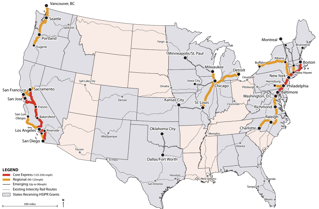
Figure 8-1: US HSR Development Map