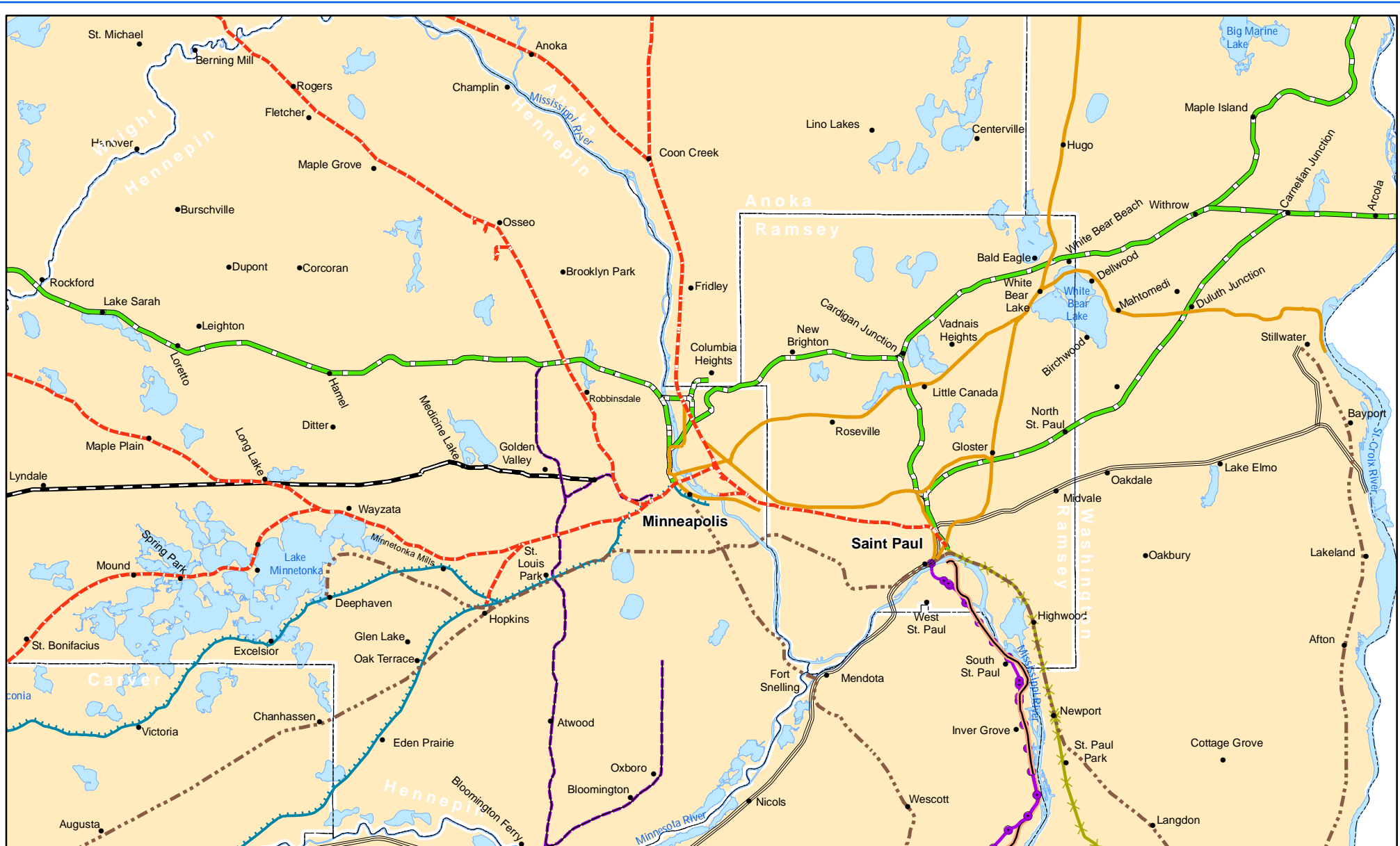
Map adapted from the MN DNR division of Fish and Wildlife 100k Lakes and Rivers and 100k Hydrography, Railroad Commissioners Map of Minnesota, 1930, and MN DOT Abandoned Railroads GIS data.