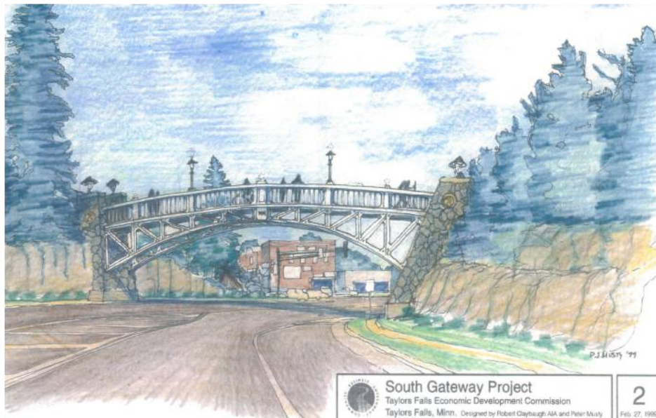
Proposed pedestrian bridge, Taylors Falls

A pedestrian bridge located across highway 8 near the intersection of State Highway 95 was also proposed (pictured below). Additional contacts were made to stakeholders in the northern most portion of the St. Croix Scenic Byway route to obtain additional concerns, issues or project recommendations.