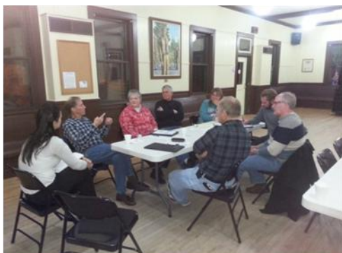
Taskforce meeting, Taylors Falls

On May 7, 2015 a third meeting was held in Bayport to further discuss potential projects for the St. Croix Scenic Byway. This meeting was intended to gather information from local units of government and stakeholders in the southern portion of the byway route near Washington County. Identifying investment priorities for the corridor was crucial for the next steps in the planning process.